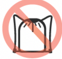
Solid color cinch bag