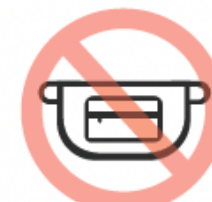
Large fanny pack