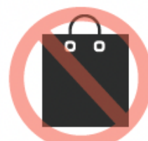
Large tote bag