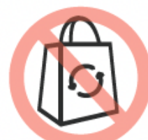
Reusable grocery tote