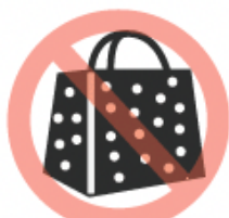
Printed patterned plastic bag