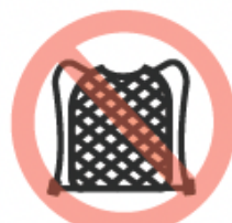
Mesh or straw bag